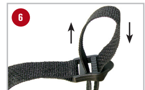
Ribs on buckle should face up. Thread strap through buckle as shown.