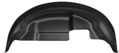
Wheel Well Guard Passenger's Side (1)

Supplied Hardware 4 - #10 SEM Screws 2 - U-Clips