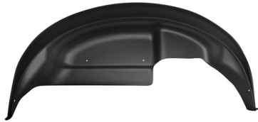
Wheel Well Guard Driver's Side (1)

Supplied Hardware 4 - #10 SEM Screws 2 - U-Clips