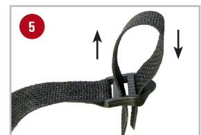
Ribs on buckle should face up. Thread strap through buckle as shown.